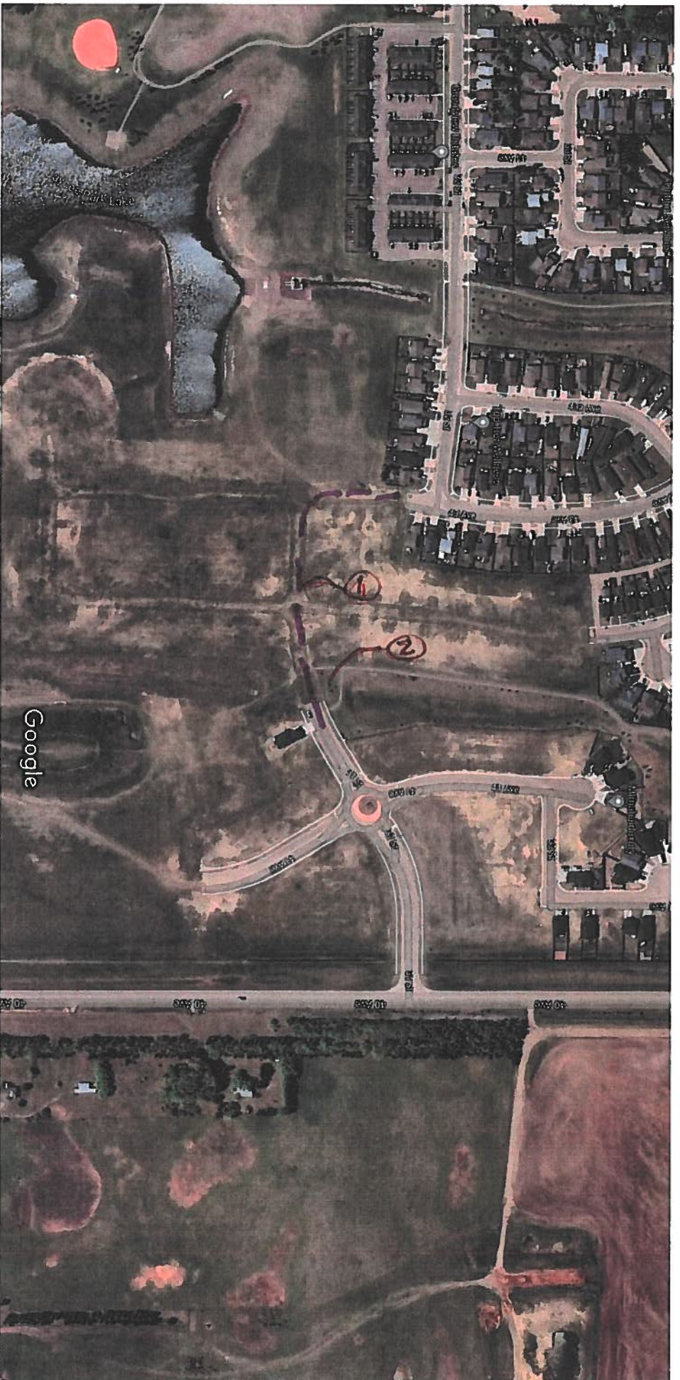
50 m